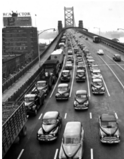
Image from the front page of the New Jersey Digital Highway website.

Additional grant partners will play an active role in developing digital collections and working with educators