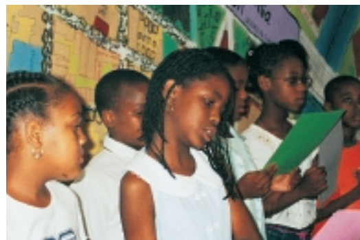
Newark elementary school students recite poetry as part of the "Art Works for Children" exhibit opening at the Rutgers–Newark Dana Library in June 2001.