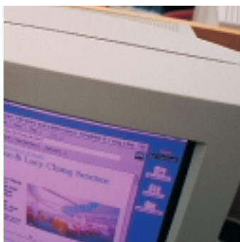
In 2000–2001, the Libraries spent $2,615,181 or 31 percent of their collections budget on networked electronic resources.

In the 2000–2001 academic year, the Libraries added 71,683 physical volumes and thirty-nine new electronic databases to the scholarly resources of Rutgers.