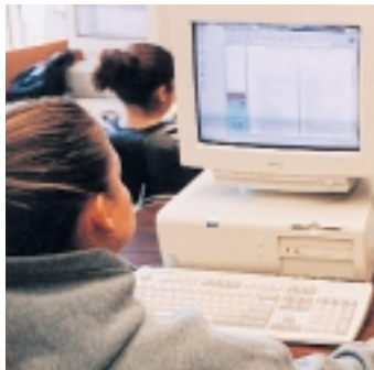
A student navigates the Rutgers University Libraries web site while participating in an instruction session at the Douglass Library.

The Rutgers University Libraries received a total of $1,815,180 in gifts and grants for 2000-2001.