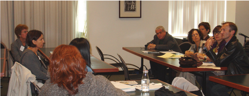
Rutgers faculty members listen to a panel discussion on how to use the USC Shoah Foundation's Visual History Archive, at a half-day faculty seminar in October. Held in Alexander Library, the seminar was sponsored by the Rutgers University Libraries, The School of Arts and Sciences (SAS), and the Allen and Joan Bildner Center for the Study of Jewish Life.