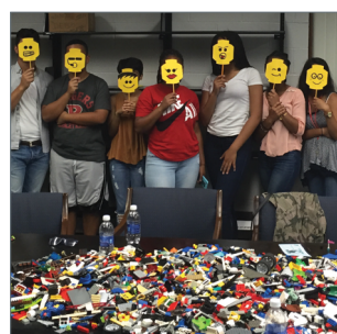
Rutgers Future Scholars use Legos at the Art Library to learn about teamwork and libraries, summer 2016.