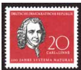
German Democratic Republic June 19, 1958 Carl von Linné (1707–1778) Bicent. of Linnaeus' classification system

In 1765, John Bartram was appointed American colonial botanist to King George III of England and since Florida had come under English control in 1763, Bartram could now undertake an expedition to the Floridas with his son William—a botanist in his own right and a gifted artist. It was during this trip that the Bartrams discovered the Franklinia alata tree growing on the banks of the Alatamaha river in southern Georgia. It was one of William Bartram's drawings of this shrub that was used to illustrate the stamp. The name of the plant was chosen to honor both Benjamin Franklin, a friend of John Bartram, and the river where it was found.