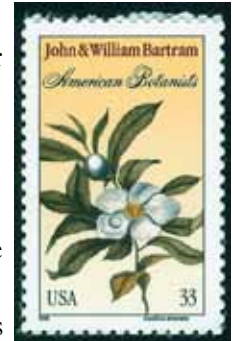
United States—May 18, 1999 Franklinia alata

On May 18, 1999 the USPS issued a 33-cent commemorative stamp honoring the father and son American botanists, John and William Bartram (1739–1823) who during their lifetimes were responsible for the majority of plant specimens shipped from the American colonies to the scientists of Europe. Considered the father of American botany, John Bartram was born in Darby, Pennsylvania and grew up with little formal education—choosing farming as his profession. Primarily self-taught through avid reading, he developed an interest in botany, beyond what was needed for his farming practices and was probably due, in part, to his interest in the herbal medicines that he used to treat his neighbors. Eventually this led to a published work on medical botany.