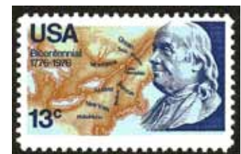
United States—June 1, 1976 Benjamin Franklin (1706–1790) & Map of North America—1776