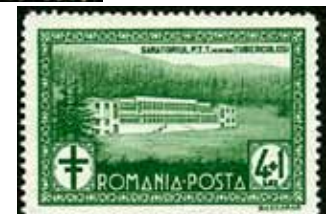
Romania 1932 TB sanatorium