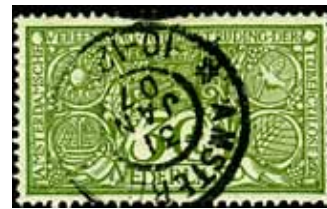
Netherlands 1906 The 4 therapies for TB: sunlight, water, air, food