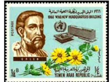
Yemen Arab Republic 1966 Claudius Galen (c 130–200 AD)