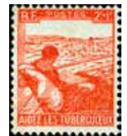
France 1945 TB patient in chaise longue