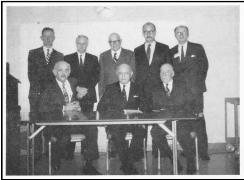
Figure 2. Participants in the New Jersey Medical History Symposium, Oct. 24, 1970