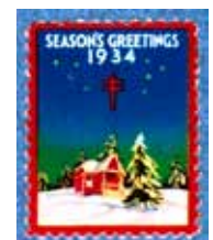
United States Christmas Seal 1934 "Little Red Cottage" sana- torium at Saranac Lake