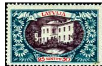
Latvia 1930 TB sanatorium, Riga