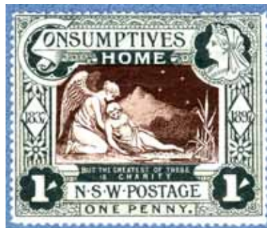
New South Wales 1897 World's first semipostal stamp