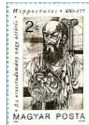
Hungary 1987 Hippocrates (460–377 BC)

In 1897, the first semipostal stamps were issued with the surcharge being used to raise money for a TB sanatorium. The initial issuance of Christmas Seals by Denmark in 1904 and the United States in 1907 was also driven by the need to raise money for these institutions.