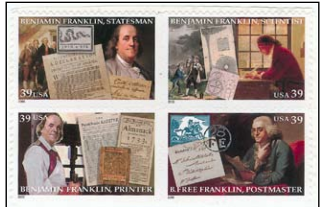
Benjamin Franklin - 300th Anniversary of birth. United States 2006